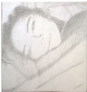
A still life ( above ) and a portrait ( above ) in silverpoint on panel prepared with gesso sottile